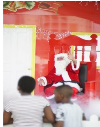
Christmas Entertainment 2021