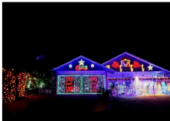
Christmas Lighting 2021

of their house and its location on the CoP website interactive map to create a Palmerston Christmas Lights Trail for community members to use to visit the registered houses. This year the competition has four winning categories, and residents who enter will be eligible to win a share in $3000 worth of cash prizes. An additional competition category has been incorporated to encourage residents to be environmentally sustainable. The Best Sustainably Decorated House prize will be awarded to the house that has used upcycled materials in their decorations. The other competition categories are: Best Illuminated House Award, People's Choice Prize and a Random Draw Prize.