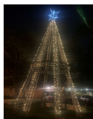
Examples of Christmas Trussmas Trees

The tree will be brought to life as part of the opening ceremony of Palmerston Christmas Wonderland on Saturday 17 December at 7pm. Visitors will be encouraged to join in the countdown of the official lighting of the tree and performers will be present to bring Christmas cheer with songs and entertainment. Visitors are able to journey under and through the Trussmas Tree and there will be plenty of opportunities to take selfies and photographs creating memories of this unique Christmas experience.