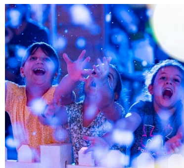
Christmas Wonderland 2021