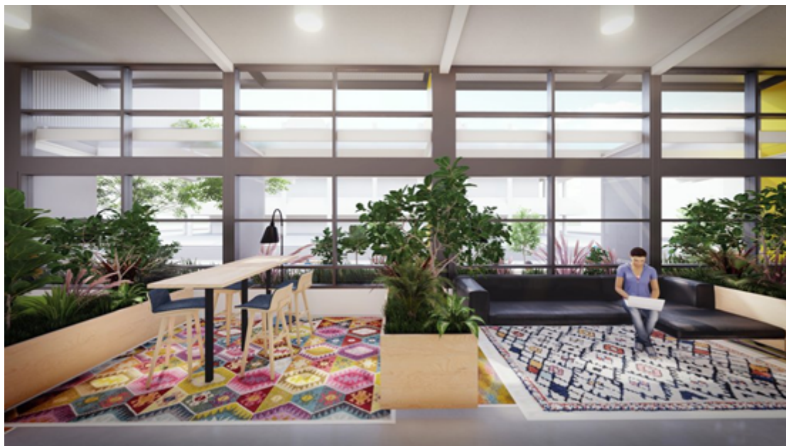
Image: Concept image of potential bookable spaces at the Palmerston Recreation Centre.

Concept options have previously been prepared for consideration, with the below an example of the type of areas that would be implemented for bookings.